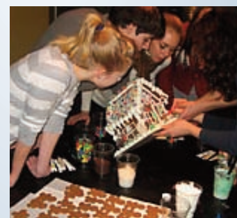
Holiday-themed Residence Hall programs.

Time of Curfew for 14 year olds? 10:00pm