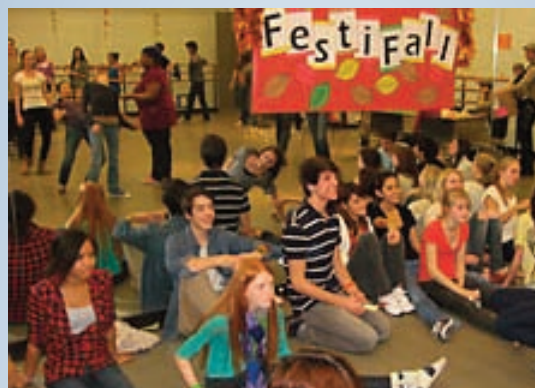
Students welcome the season with the annual "Festifall" celebration.

Number of Residence Hall programs throughout the Winter Term? 89